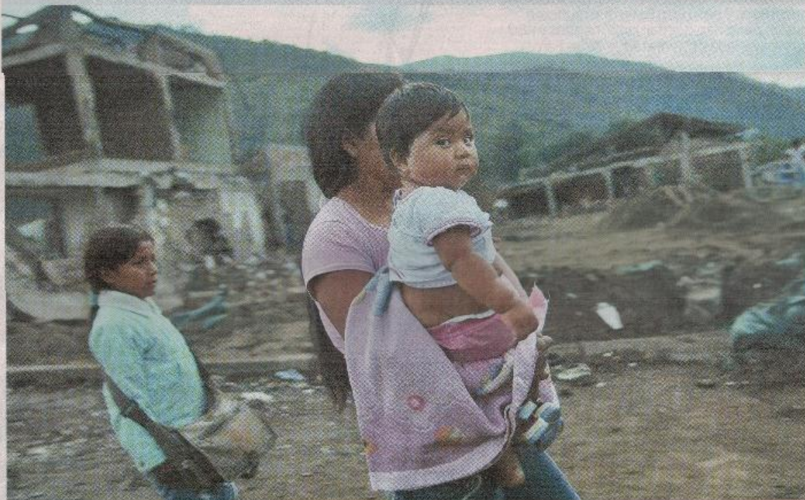
Una muestra de la desolación en que quedó Toribío, Cauca, después del sangriento ataque de los FARC.

Los pobladores del municipio caucano tratan de recobrar su rutina tras el ataque terrorista del sábado que destruyó el pueblo. Creen que cuando termine el escándalo volverán a vivir en el fuego cruzado entre guerrilla y FFMM. / Tema del día p. 2